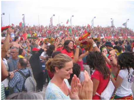
Crowd cheering in the face of the big success of the meeting! (Sincerely!!)

Building on the successes of the 2004 and 2005 conferences in Stockholm and Bristol, 250 (to be confirmed) people from 13 European and 7 non-European countries attended this year’s SESAM conference in Porto. Besides our traditional acute care clinical specialties: anesthesia, intensive care and emergency medicine, also surgery and obstetrics were again well represented, and, I believe for the first time, simulator-based training applications in neonatology and urology were discussed in